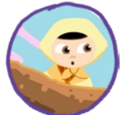
Friend Macbeth's Friend